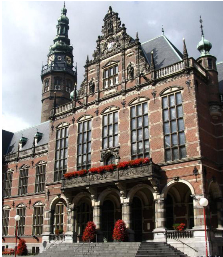
KNOWLEDGE CENTRE: University of Groningen, the Netherlands.